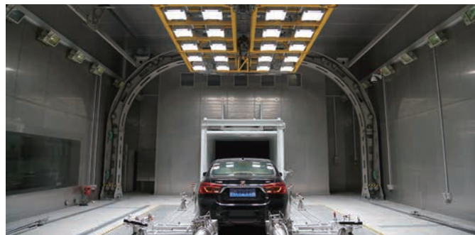
Satake's car environment simulation test chamber.

"Other areas such as the food industry, water treatment, or garbage recycling, have asked us for many types of mixing techniques. We develop different technologies for each industry's needs. How